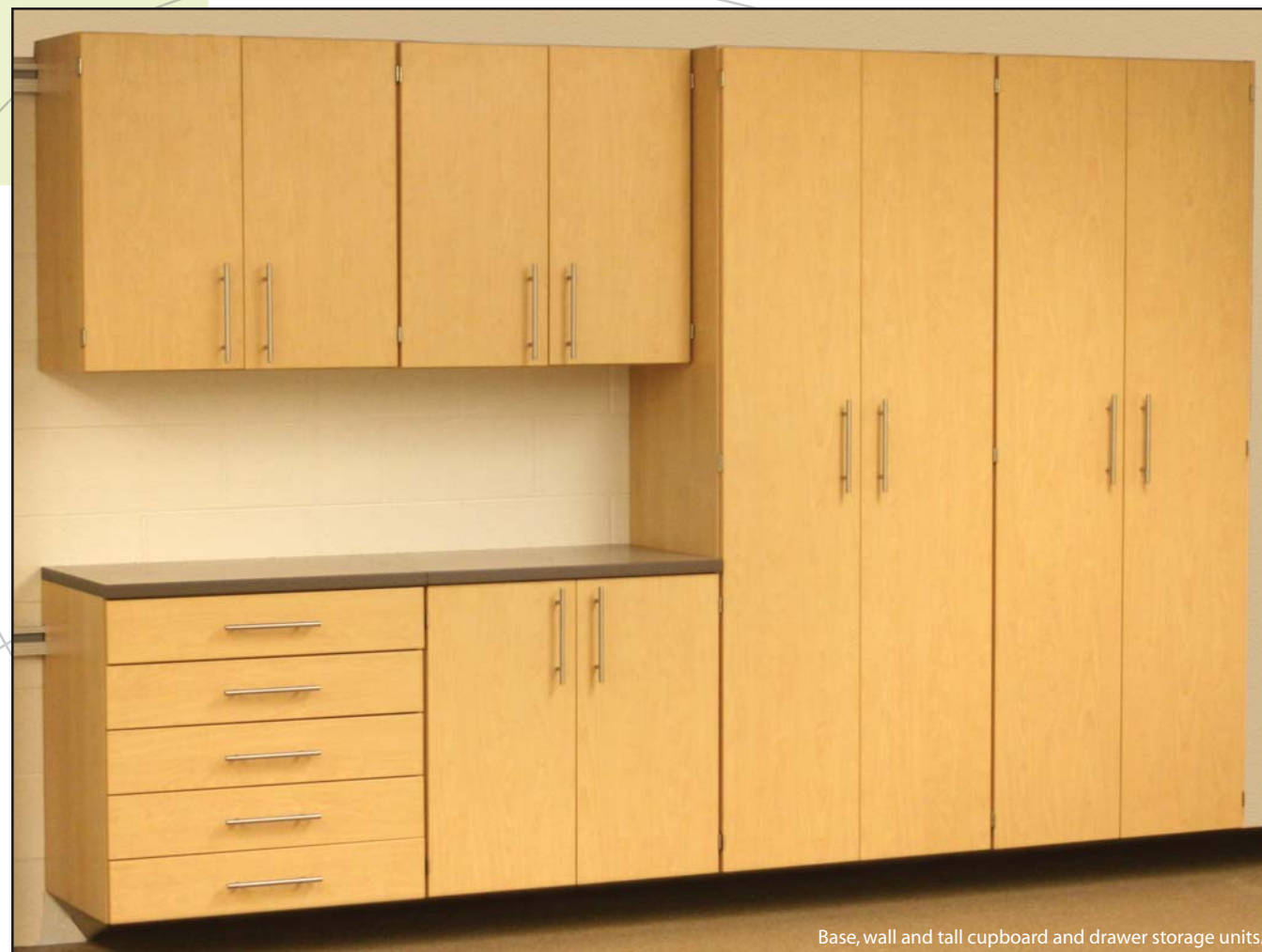
Base, wall and tall cupboard and drawer storage units.

elements™ is a collection of four basic groups of furniture solutions. Each one works independently and in harmony with the others to offer a unique system that provides you with complete control to create functional and attractive spaces.