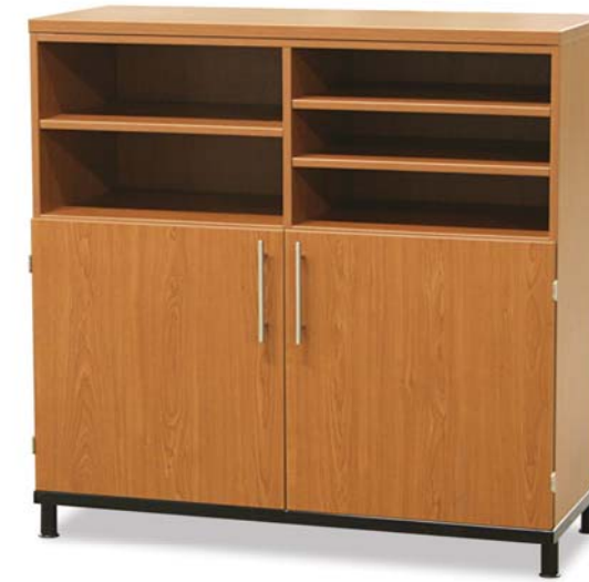
Freestanding combination storage unit.