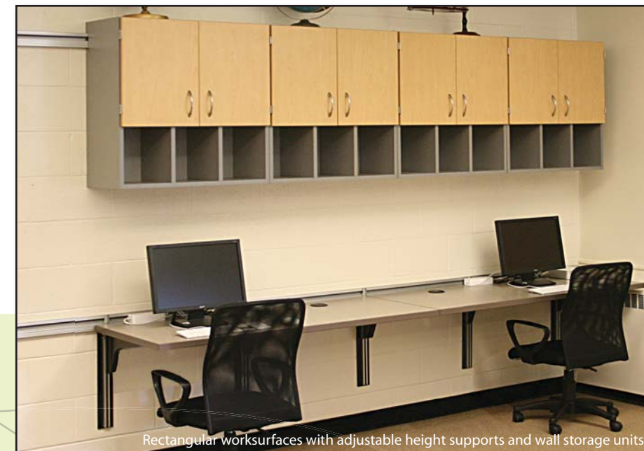
Rectangular worksurfaces with adjustable height supports and wall storage units.