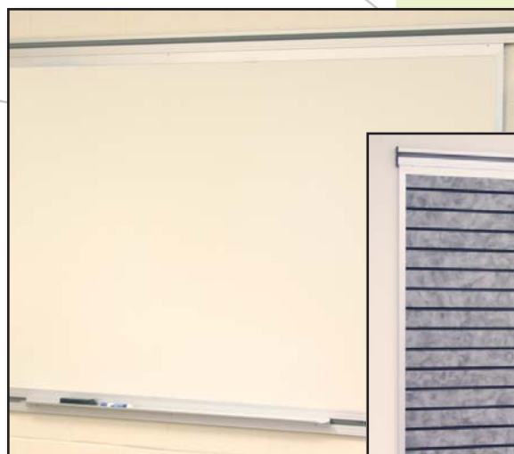
Marker Board Tile with Utensil Tray.