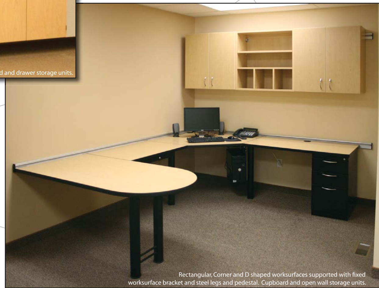
Rectangular, Corner and D shaped worksurfaces supported with fixed worksurface bracket and steel legs and pedestal. Cupboard and open wall storage units.