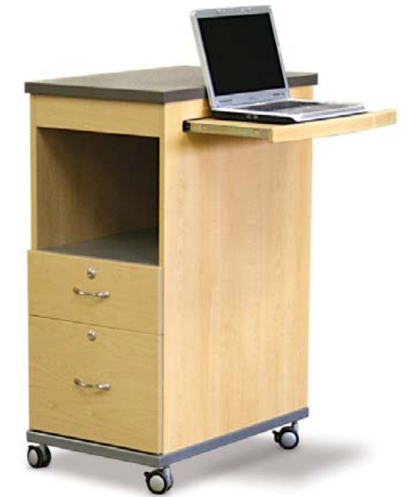
Mobile Personal Cabinet with pull-out work surface.