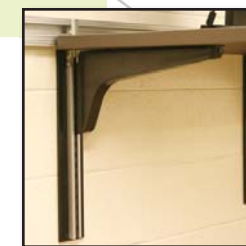
Worksurface standard accepts support arms and offers adjustable height.